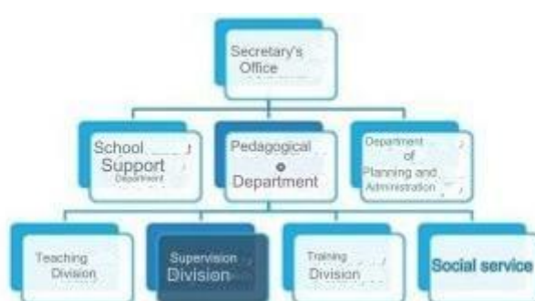
Figure 1 . Hierarchical Structure of the Department of Education of Limeira/SP. Self elaboration.

Supervision Division (as shown in figure 1), responsible for monitoring and supporting the municipal public education network and performance in the private children's network. The prerequisite for occupying this role is to have a degree in Pedagogy with a full degree or to have completed a postgraduate degree in Education, and also have at least five years in official public teaching, of which two of these must be in support positions or functions. pedagogical (coordination or direction), or at least eight years of official public teaching. In this way, these professionals enter this role through a public examination, sharing something in common: working in public teaching.