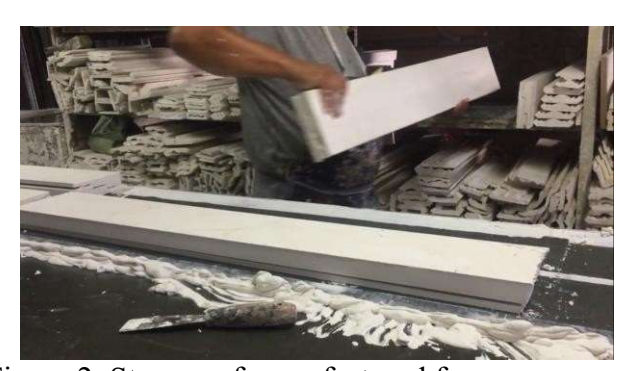
Figure 2: Storage of manufactured frames.

The proximity of the shelf where the frames are stored and the manufacturing table makes it easy to transport after production and reduces the risk of breakage. Figure 2 shows the moment when the plasterer removes the frames on the table and positions them on the shelf.