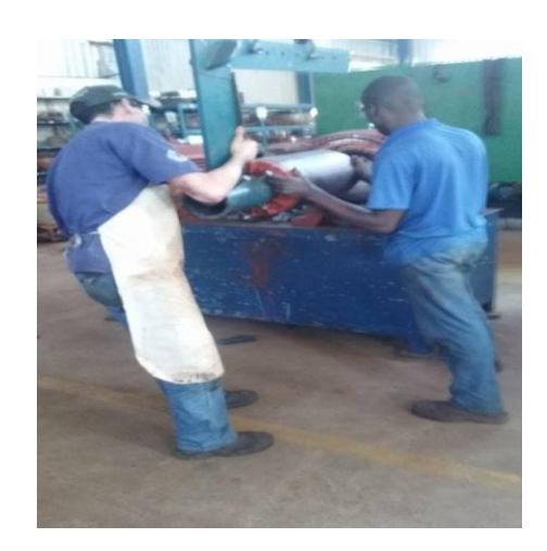
Figure 4 - Manual assistance from mechanics during engine fitting

At the moment when the shaft is to be placed in the opening of the casing, any vibration of the bridge causes the shaft to sway and collide with the electrical wiring. This collision can break one of the wires, causing complete damage. Because this is a serious issue, the process of joining the shaft to the casing creates tension among the workers, leading two mechanics to manually guide the shaft into the correct position towards the casing