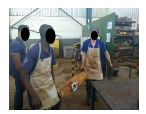
Figure 1 - Manual loading of engines in pairs

Therefore, whenever a mechanic needs to transport a part or engine, they seek assistance from a colleague, and the transport is done in pairs without using the mobile bridge. According to the mechanics' perspective, this strategy results in an advancement in service and an improvement in its quality. This is because the time spent operating the mobile bridge is saved, and the risk of damage to the electrical system is reduced (Figure 1).