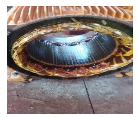
Figure 3: Electrical part of the engine enclosed by the casing